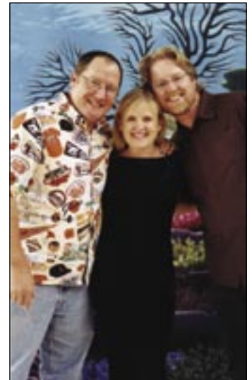
John Lassitar and Andrew Stanton